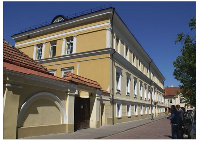
Figure 3. This is the building on A.Volano Gatve where Sniadecki had his laboratory on the second floor. The building is now the Lietuvos Respublikos Svietimo Ir Mosklo Ministerija (Ministry of Science and Education).