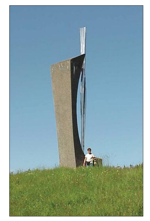
Figure 12. The nickel monument, "Form för Nickel" in Los, was erected in 1971 by Olof Bernhard Hellström (1923–), sponsored by the township of Los, International Nickel Limited, and the Royal Swedish Academy of Sciences.

ments, the differentiation between metals was obscure, and it was natural to suspect that any new "discoveries" were simply new blends of the old metals. Any experimentation would tend to "prove" this view, because a preparation was almost always contaminated with impurities.