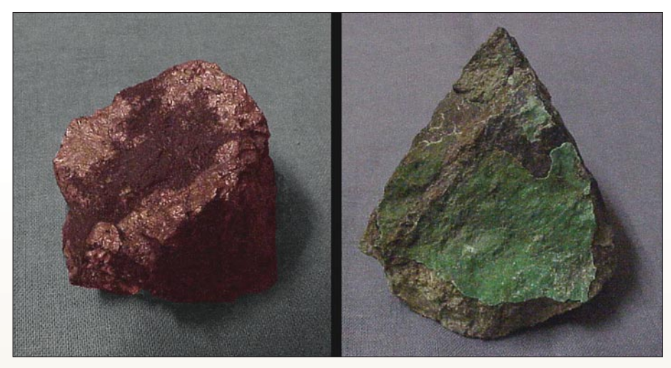
Figure 7. Copper can oxidize to form a green patina, for example, as is seen with the Statue of Liberty. The mineral Kupfernickel (left) confounded the medieval miners; it appeared to be copper, because it can grow a green coating (right), but in the hands of the coppersmith it didn't behave. Obviously, it was cursed, hence its name "copper devil" (German). Actually, the mineral was nickeline (nickel arsenide, NiAs), which oxidizes to form apple-green annabergite (nickel arsenate, Ni<sub>3</sub>(AsO<sub>4</sub>)<sub>2</sub>•8H<sub>2</sub>O). From the element collection of the authors.

The discovery of nickel. Miners in Germany had often seen reddish stones which could be dissolved in nitric acid to produce greenish solutions, behaving like copper. However, it was impossible to obtain any metallic copper from these solutions. The undesirable stones were called "Kupfernickel" (copper-devil) (Figure 7) since they obviously were cursed.<sup>5</sup>