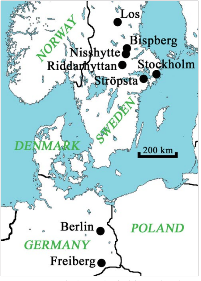
Figure 2. Sites associated with Cronstedt and nickel. Cronstedt was born at Ströpsta (N59° 10.88 E17° 27.05) and died at Nisshytte (N60° 16.99 E15° 43.56). Nickel was found in Los at the Koboltsgruva (cobalt mine) (N61° 44.52 E15° 09.40); the nickel monument is 250 meters southeast (N61° 44.48 E15° 09.66). An ingot of nickel was prepared at the Laboratorium Chymicum in Stockholm (N59° 19.59 E18° 04.05). Cronstedt visited Brandt's cobalt mines at Riddarhyttan (N59° 49.64 E15° 33.00). Cronstedt discovered scheelite (tungsten source) at Bispberg Klack (N60° 21.44 E15° 48.92). From the Kuhschacht mine in Freiberg, Germany (N50° 54.81 E13° 20.82) a sample of nickeline was obtained from which Cronstedt procured nickel which he showed was identical with Swedish material.

Cronstedt's systematic identification of minerals.<sup>1</sup> Cronstedt, having studied at Uppsala, was very much aware of the work of Carl von Linné (Latinized "Carl Linnaeus," 1707–1778) who was professor of botany there. Linné created a comprehensive binomial nomenclature (Genus, species) for flora and fauna.8 Linné depended on external characters such as color, texture, shape variations, etc. He was aware that his taxonomy was "artificial"he once stated "Deus creavit, Linnaeus disposuit" (God created, Linnaeus organized)8-but fortuitously his method of "counting pistils and stamens" or "describing teeth and bones" actually reflected deeper relationships, viz., eventually the sequence of evolution and even the