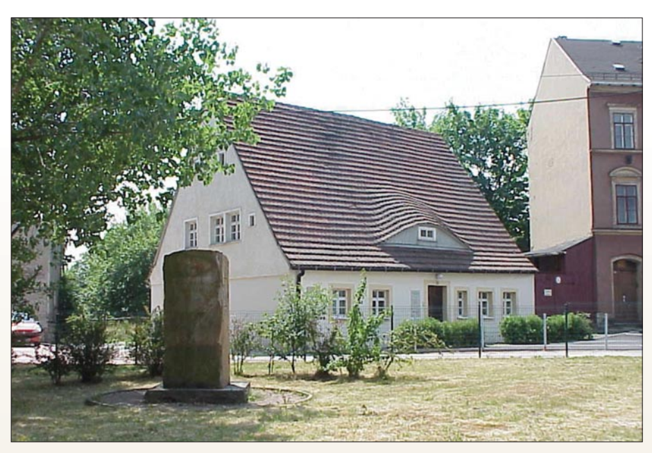
Figure 11. The Kuhschacht ("cow shaft") mine in Freiberg, Germany was once a prolific provider of silver and also furnished the Kupfernickel that Cronstedt studied. The mine was operational 1514–1834. This monument on Wernerplatz on Bahnhofstraße (Railroad street) marks the site of the original shaft (now filled in). The "Huthaus" (mining shack) dates from 1700 and is today used as a dentist's office; the peculiar attic window—"eye"—is a "Gaubenfenster" or "German eye." On the monument, Alexander von Humboldt is mentioned as a student of the Freiberg Mining Academy (1791–1792).

The acceptance of Cronstedt's discovery. In the pre-Lavoisier era, metals were considered to be the combination of a calx with the flammability principle (phlogiston). Whenever a new metal was isolated, such as the medieval