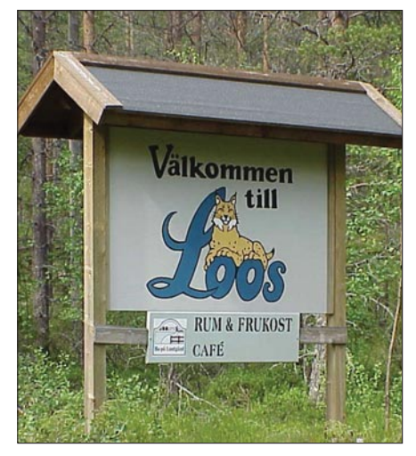
Figure 8. The welcoming sign to Los uses the old spelling "Loos." Sweden mandated a sweeping orthography reform in 1906 (e.g., "Upsala" to "Uppsala," "Loos" to "Los," etc.), but the old spelling persists for historical names, e.g., the name of the mine. The sign reads: "Welcome to Loos! Rooms and breakfast. Cafe." With only a few hundred inhabitants, Los is far north of the populated areas of Sweden, and is accessible only by automobile.