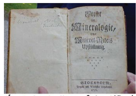
År af höggrön fårg, och innehålles i Rupfernickelens ochra eller wittring wid Los Roboltgrufwor.

Figure 5. An original 1758 copy of Cronstedt's Försök till Mineralogiens eller mineral-Rikets upställing ("An attempt at mineralogy or arrangement of the Mineral Kingdom"), provided by our Swedish hosts.<sup>4n</sup> The author's name has been penciled in at the upper left because it was published anonymously. LOWER: the specific entry for nickel vitriol<sup>10cd</sup>: "Is of a deep green color, and is contained in/Kupfernickel or in other erosion products/at the Los Cobalt mine."