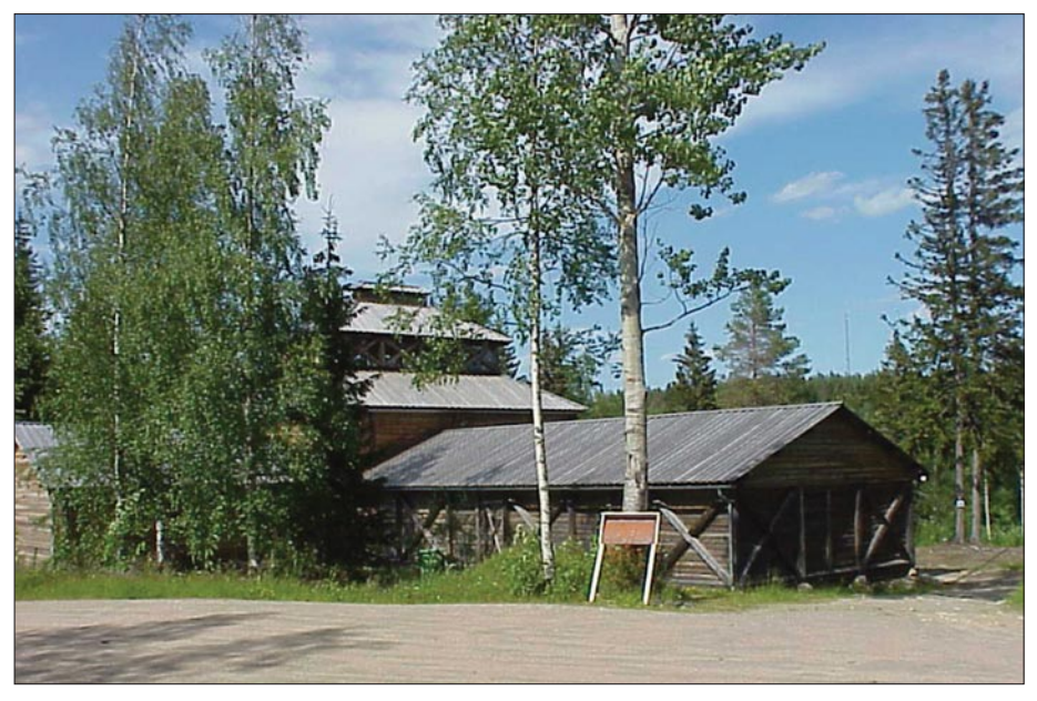
Figure 9. The Koboltsgruva ("Cobalt Mine") in Los is open to tourists and has numerous exhibits and offers a mine tour. This mine dates from the 1700s and has been worked for copper, bismuth, and cobalt. A cobalt glassworks was established at Sophiendal, about 8 km southeast; it was operational only 1763–1771 and today only scattered ruins remain. As the authors descended into the mine, their Geiger counter (which they always carried with them) showed an extremely radioactive layer about one meter thick. This was commonly observed on their travels through mines in Europe!

He subsequently obtained Kupfernickel from Saxony, Germany (Figure 11) and found it also produced the same new metal. He presented his findings<sup>7bc</sup> to the Swedish Academy of Sciences in 1751 and 1754 and called his new metal"nickel."<sup>7c</sup> (Note 1)