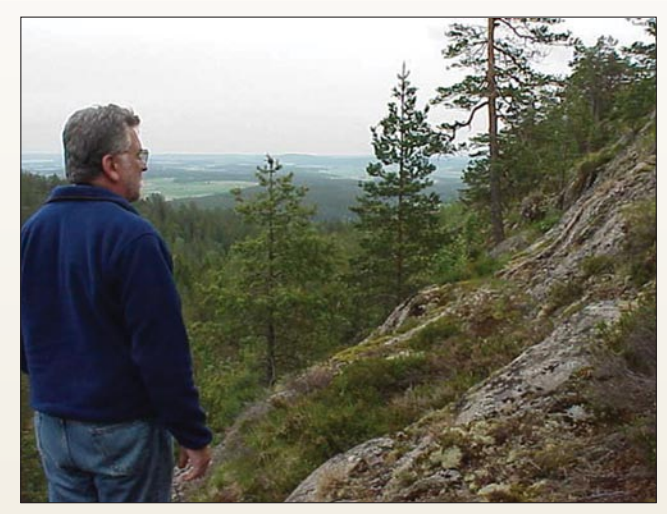
Figure 14. Bispberg Klack is a 314-meter mound where various iron mines have been worked during the past millennium. Somewhere down this slope in 1751 Cronstedt discovered the "heavy-stone" which was named "scheelite" in 1821.

At the end of the 18th century, Lavoisier published his Treatise <sup>16</sup> where he abandoned