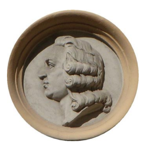
Figure 1. Axel Fredrik Cronstedt medallion, located in the Gamla Jernkontoret ("big iron office"), Kungsträdgårdsgatan 6, Stockholm (N59° 19.85 E18° 04.37), located only 250 meters south of the famous Berzelius statue.<sup>44</sup> The medallion was prepared in the 1870s by Johan Frithiof Kjellberg (1836–1885), after an earlier portrait. Kjellberg's best known work is the statue of Carl von Linné in the Humlegården (N59° 20.34 E18° 04.37).

The critical role of the blowpipe. Cronstedt was the first person to use the blowpipe in systematic analysis of minerals.<sup>6</sup> This simple tool was originally used by the goldsmiths to heat and solder a pin-sized spot in jewelry, but was adapted to the identification of components of small ore samples. In this method, the operator used a brass tube to blow a concentrated stream of air through a flame (e.g., candle) to heat a localized region on a test specimen. By varying the position of the blowpipe in the flame, one could treat the sample with an oxidizing flame or a reducing flame (or, in pre-