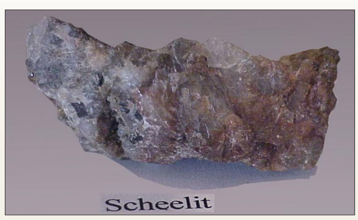
Figure 15. Scheelite (discovered by Cronstedt) sometimes forms octahedral crystals, but it is more commonly amorphous like this specimen. This sample is displayed in the acclaimed Scheele museum in Köping, Sweden.<sup>4c</sup> Swedish miners and mineralogists call this form of scheelite "fruset snor" ("frozen snot") for obvious reasons.<sup>4a</sup> Night rock hunters search for this mineral with portable UV lamps, which cause scheelite to fluoresce a beautiful blue, very much like diamond's fluorescence.