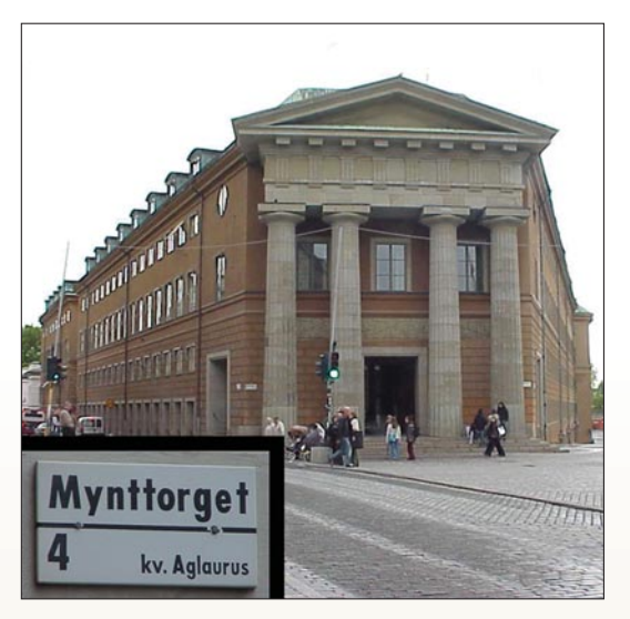
Figure 4. Near the Sverige Riksdag (Swedish Parliament) is this Annex (government offices) on Mynttorget (Mint Square) (inset). This is the location of the previous Royal Mint, taken down in 1784