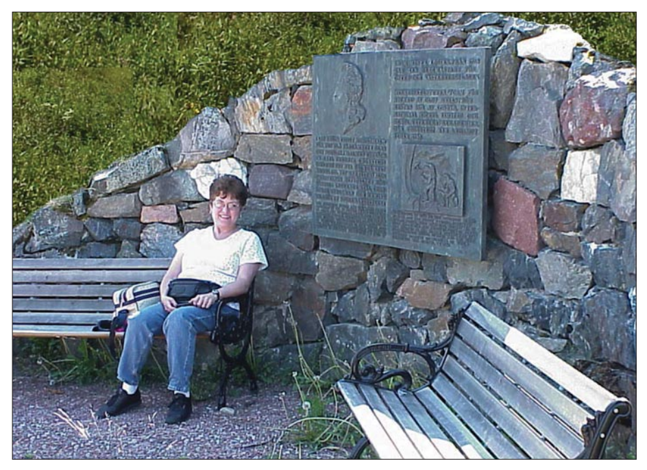
Figure 13. At the base of the nickel monument, beside the main road through town, is a memorial to Cronstedt, in both Swedish and English. The English portion reads: "For centuries cobolt [sic] ore was mined in the township of Los to be used in the colouring of glass and porcelain. In 1751 Axel Fredrik Cronstedt (1722–1765) discovered in the ore the new element nickel which was later to become of worldwide importance in high quality alloyed steel. Cronstedt, metallurgist and chemist, belongs to the great pioneers in the field of mineralogy...."

Brandt was the first to attack the question of new metals.<sup>2a</sup> In 1733, when he announced the discovery of cobalt,<sup>13</sup> he listed six true metals