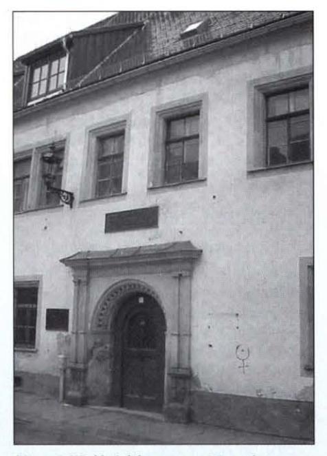
Figure 4. Winkler's laboratory on 5 Brennhausgasse. This small museum may be visited by appointment through the university.

al mineral called "argyrodite" (named from the Greek "silver-bearing;" see Figure 3). From this mineral Clemens A. Winkler (1838-1904), a professor at the Bergakademie, discovered germanium in 1886. He first performed detailed blowpipe analysis (Note 2) and ascertained the mineral held 75% silver and 18% sulfur, hence a loss of 7%. Searching for the unaccounted material, Winkler fused a sample with sodium carbonate and sulfur, separated the aqueous filtrate from the black silver sulfide, and added concentrated hydrochloric acid, which threw down a new flaky, white sulfide. He isolated the new element by passing hydrogen over this sulfide.8 Argyrodite is now known9 by the formula Ag8GeS6.