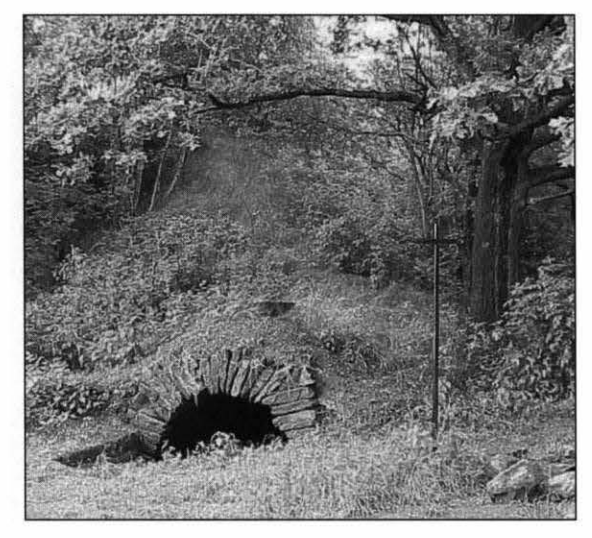
Figure 9. One of the few mine entrances remaining in the Himmelsfürst ("heavenly prince") region.