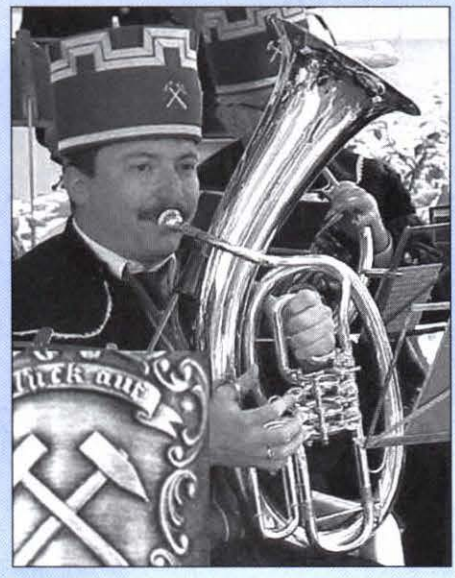
Figure 2. Frequent festivities are held celebrating the mining tradition. On the hat of this musician are the famous "crossed hammers" ("Eisen und Schlägel"), the symbol of the miners in the Saxony and Bohemia regions. Inset: close-up of pewter chalice with "crossed hammers" and the miner's greeting "Glück auf!"

alf a millennium ago, alchemy was maturing into chemistry by advancing on two fronts: medicine and mining. In medicine, Paracelsus (Phillipus Aureolus Theophrastus Bombastus von Hohenheim, 1493–1541) was promoting the use of chemical preparations and preached that a medicine possessed a quintessence that could be extracted and used to combat disease.<sup>1</sup> In mining, Georgius Agricola (Georg Bauer, 1494–1555) was preparing classic treatises on mining and metallurgy.<sup>2</sup> The most famous work of Agricola was De Re Metallica, which appeared a year