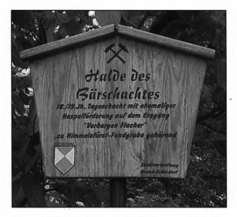
Figure 10. Historical post identifying an old shaft. The shafts have long been filled in and little evidence remains except for a few talus piles and stone ruins.

Figure 8. Maps of Freiberg and Himmelsfürst Mine. Olbernhauer Strasse from Freiberg proceeds south (Route 101) through Brand-Erbisdorf, about 5 km south. About 2 km south of Brand-Erbisdorf, a right turn (west) at "A" (N 50° 51.48', E13° 19.15') leads one into the general Himmelsfürst region south of Sankt Michaelis. "B" = N 50° 51.30', E 13° 18.37'; "C" = N 50° 51.38', E 13° 18.12'. The "D" region holds several historical markers and evidence of mines (talus, stone ruins): N 50° 51.74', E 13° 17.77'; N 50° 51.84', E13° 17.62'; N 50° 51.57', E 13° 17.40', among others. The inset of Freiberg shows the location of Winkler's laboratory at 5 Brennhausgasse ("E" = N 50° 55.21', E 13° 20.70'). About 100 meters down the street (west) is the famous Werner Mineral Museum (Mineraliensammlungen der Bergakademie).